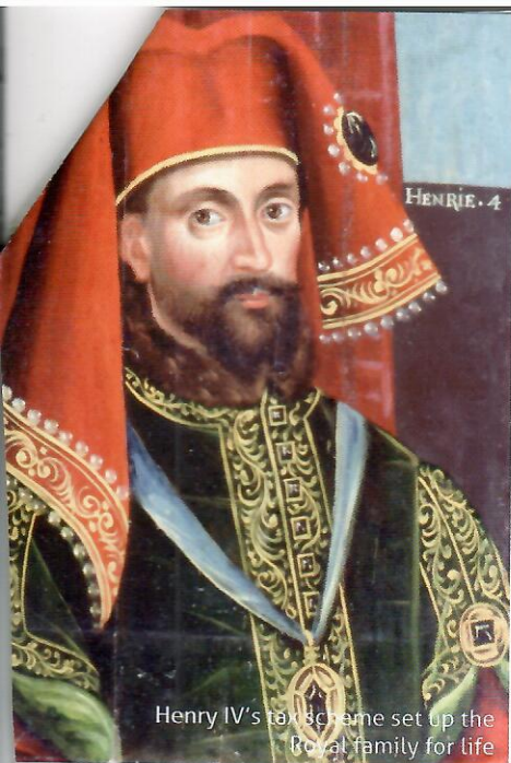
Henry IV's tax scheme set up the royal family for life

the asset by separating it from the Crown Estate, but that's not all. Its status means that it is not subject to 134 capital gains tax 135 , when handed down, nor income tax. Covering 18,433 hectares, the Duchy owns land and properties throughout Britain, including Lancaster Castle, but the jewel in its crown is the Savoy Estate. The A-class central London prime real estate goes from the fashionable 136 Strand to the iconic Savoy Hotel – yes, the Queen owns that too. The Duchy of Lancaster brings around GBP 18 mln to the family table, while her son, Charles, the Prince of Wales has his own little earner 137 in the form of the Duchy of Cornwall. It is even bigger, covering an area of over 53,000 hectares, incorporating large parts of Cornwall and most of the Isles of Scilly. Like the Duchy of Lancaster, it was another asset management plan constructed by Henry IV, which is also beyond the reach 138 of the taxman 139 . It's a neat 140 arrangement because the Duchies are treated as national assets, but are held in trust 141 for future generations of sovereigns.