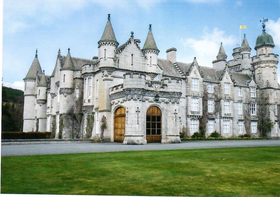
Balmoral Castle, Scotland

133 to ring-fence sth tə rɪŋ fens 'sʌmθɪŋ odgrodzić coś, wyodrębnić; uczynić nienaruszalnym (UK)